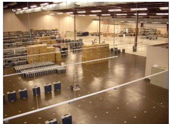
The warehouse empties as equipment is delivered to the polling places.

In the next issue, look for the next installment of Election Readiness, covering inside events leading up to Election Day.